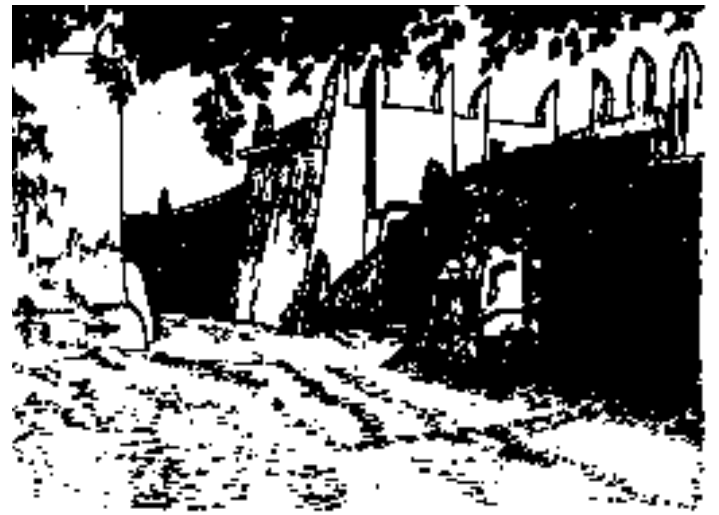
Figure 9.30 Daura, butchers' ward